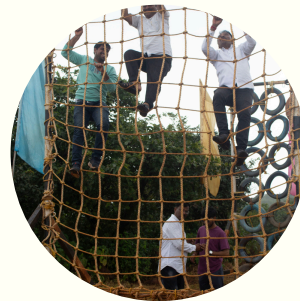
MCF ROPE COURSE