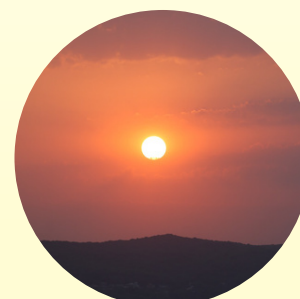
MCF SUNSET POINT