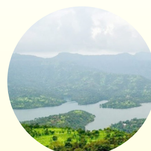
TAPOLA (MINI KASHMIR)