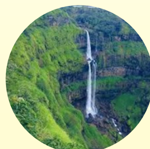
LING MALA WATER FALL